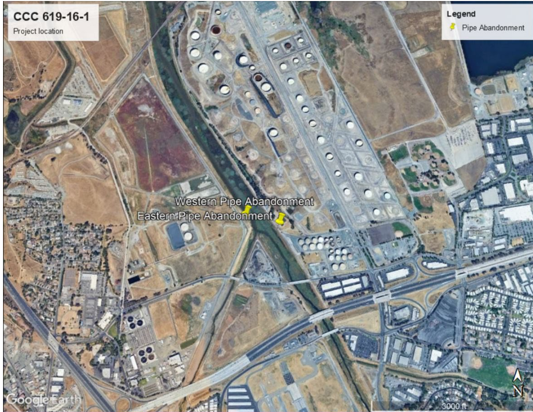
2) Location Map