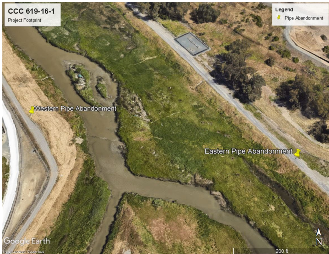
3) Project Footprint